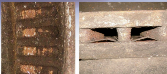
26 months/32,789 miles WITHOUT Webb LifeShield™ protection

Testing performed through TWO winters in the Salt Belt